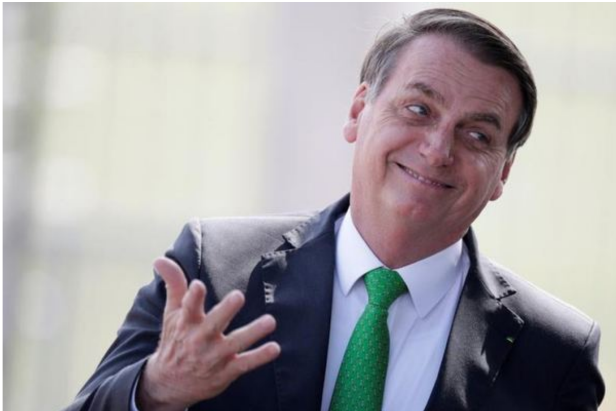
Brazil's President Jair Bolsonaro.

Brazil and the US are the only countries to record more than a thousand deaths in the past 24 hours from COVID-19.