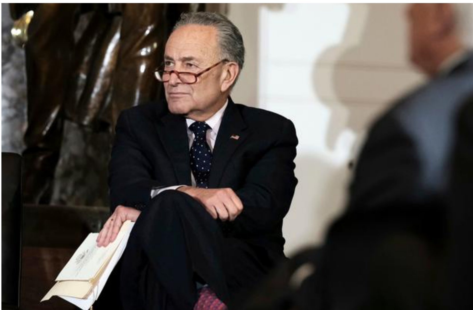
Sen. Chuck Schumer, D-N.Y., attends a ceremony to unveil a portrait honoring former Speaker of the House John Boehner on Capitol Hill, on Nov. 19, 2019, in Washington.

"Veterans' groups remain deeply concerned that the VA has made large purchases of this drug and appears to have administered it to veterans despite the well-known, and in some cases, fatal risks," he wrote Wilkie.