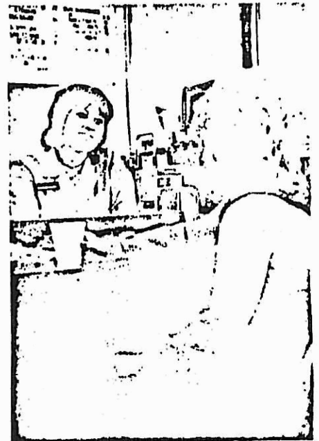
"Supergroup" therapy in patient-run coffee shop provides testing ground for new personalities.